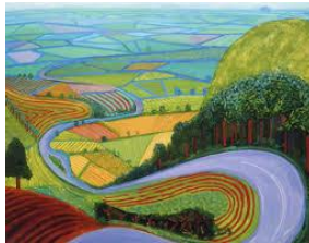
Garrowby Hill - David Hockney